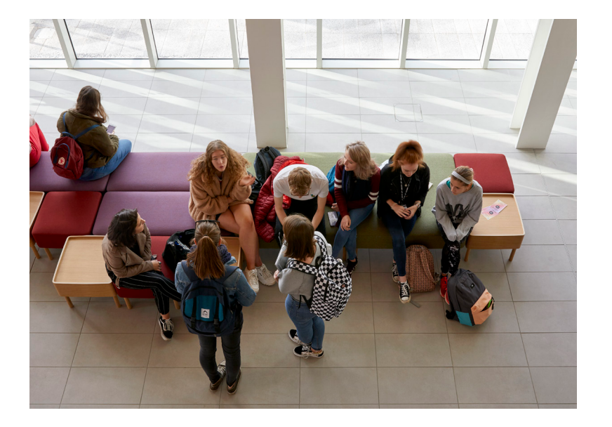
1. The Teaching and Learning Building has a variety of spaces for students to meet and study. \,