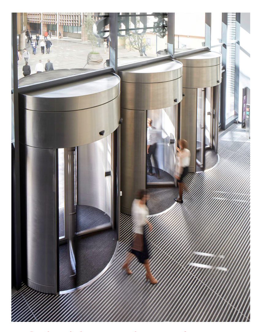
2. 5 Broadgate is home to more than 5,000 employees.

ZS From my experience with Make, I feel that was your reason for inviting me in. I didn't have a Make person coming with me when I went to 5 Broadgate